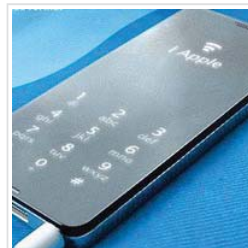
The Best Feature of iPhone 5!