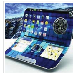
The Most Amazing Smartphones