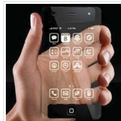
Top 10 Best Upcoming Cell Phones!