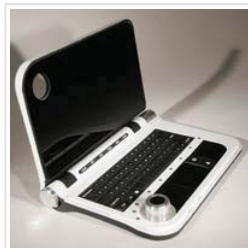
The Cheapest Laptop In The World