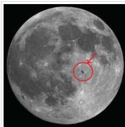
Unbelievable Space Photos!