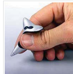
What Do You Think That Is?