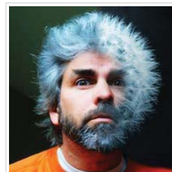
Shocking Fact About Photoshop!