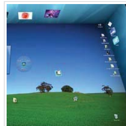
Make Your Desktop Look Like Real 3D!